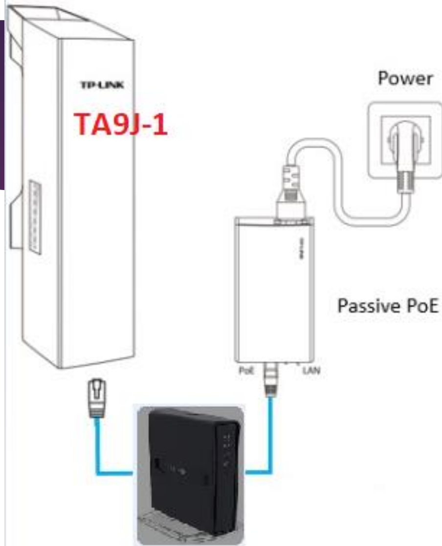
MikroTik hAP ac lite RB952UI